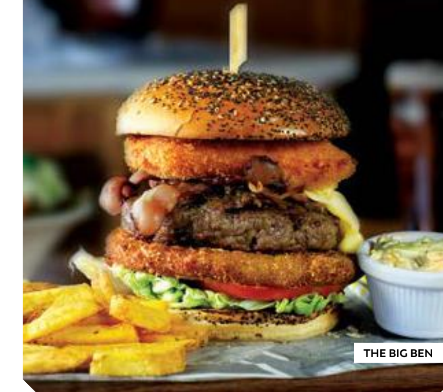
THE BIG BEN