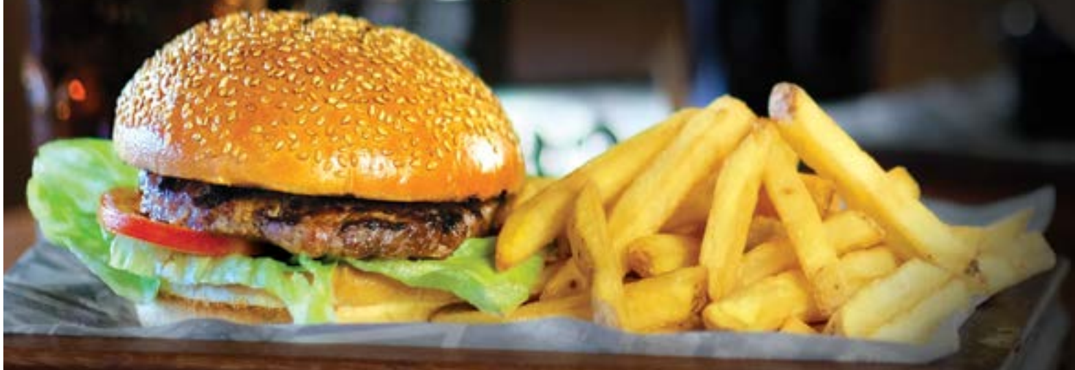
BURGER & CHIPS