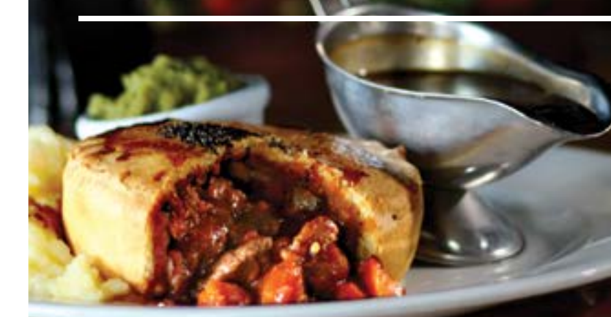
STEAK & GUINNESS

Short crust pastry casing, pie filling, mushy peas & mashed potatoes